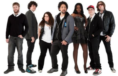
The band, apparently in purgatory (cue the white background).