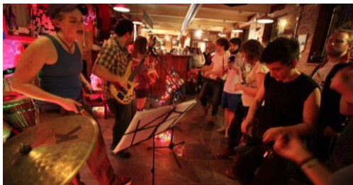
Rockers rocking out at Hudson River Coffee House on Quail Street.