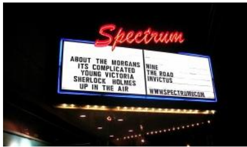
It looks like they have movies to show.