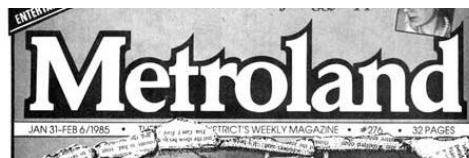
Metroland, circa 1985. Tim Burton guest edited.